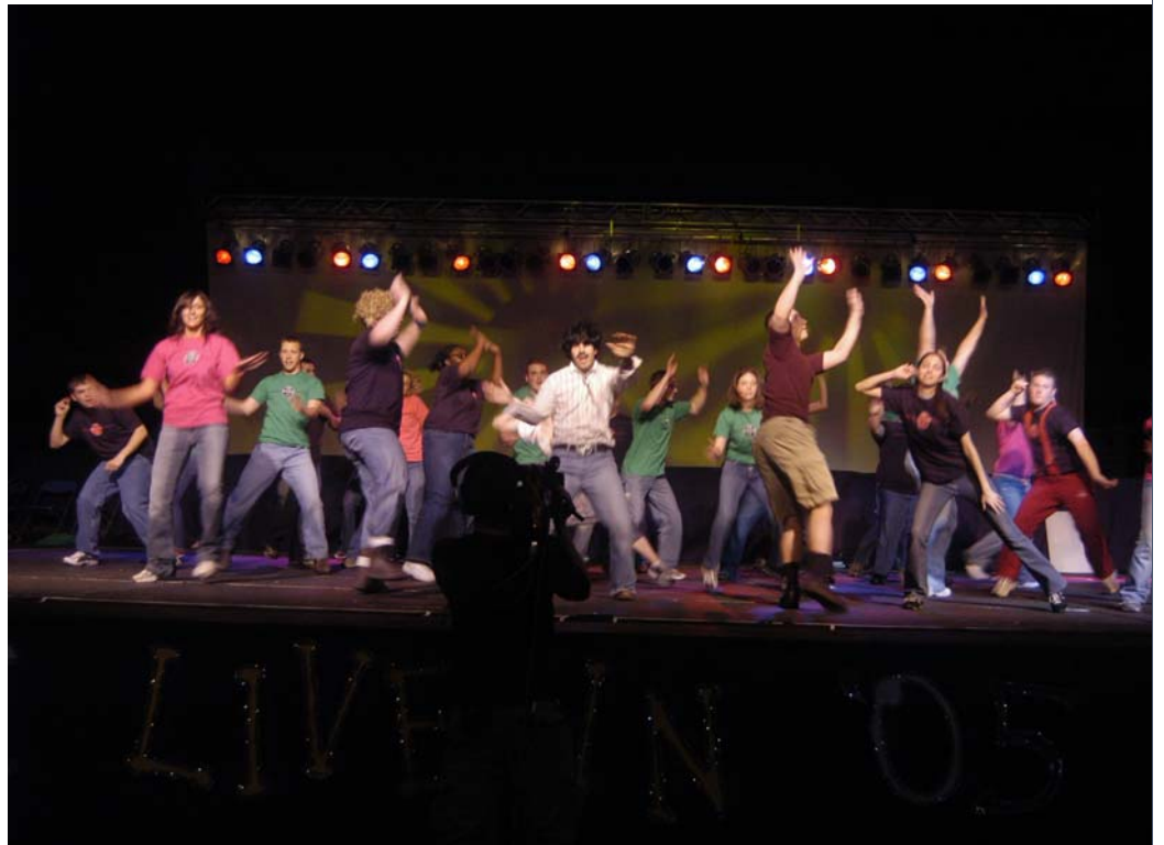
The 2004-2005 class performing the opening act of Songfest along with Mortar Board National College Senior Honor Society