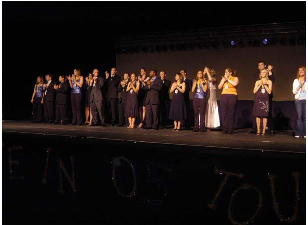
The tapping of the 2005-2006 Blue Key class at Songfest