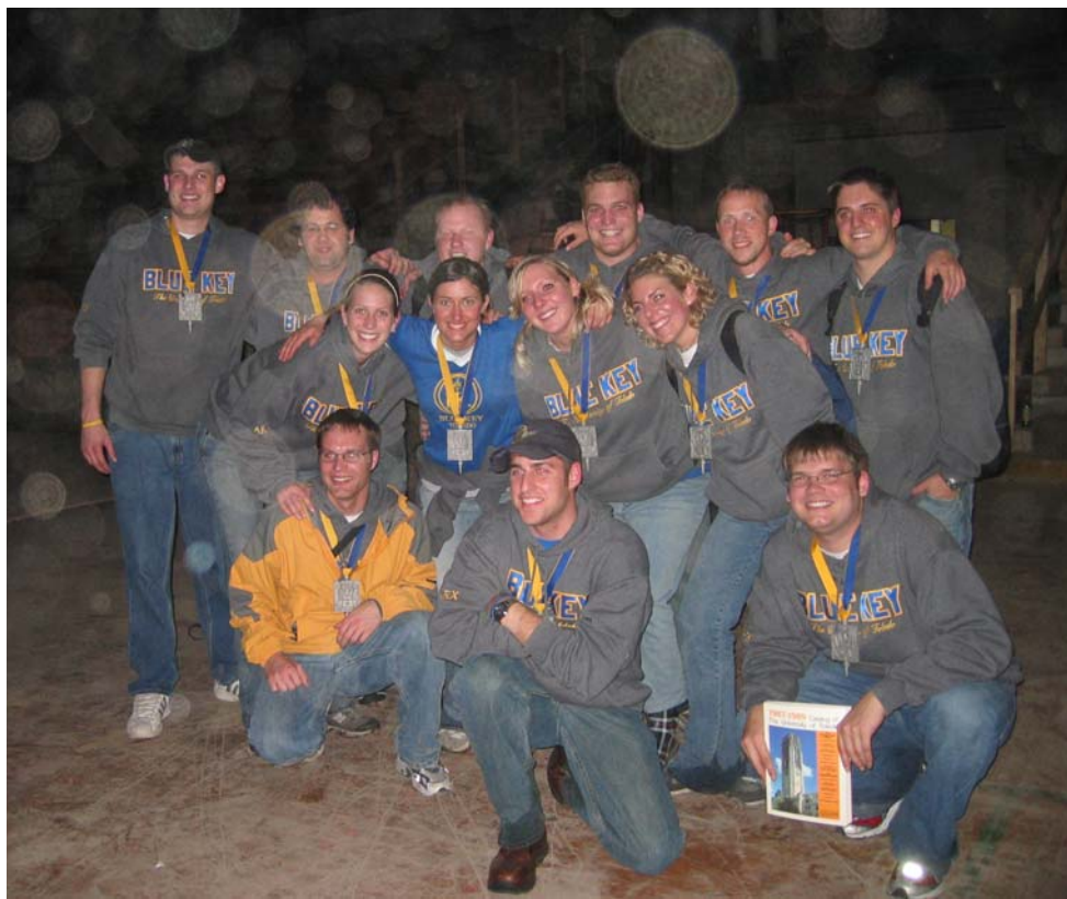
The 2004-2005 class at initiation