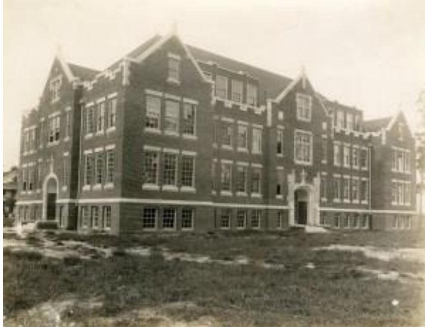
West and South Facades of Language Hall, circa 1924 (Renamed Anderson Hall in 1949)