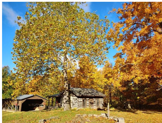
The Blue Key National Office in Millersburg, Ohio, 2007-2017